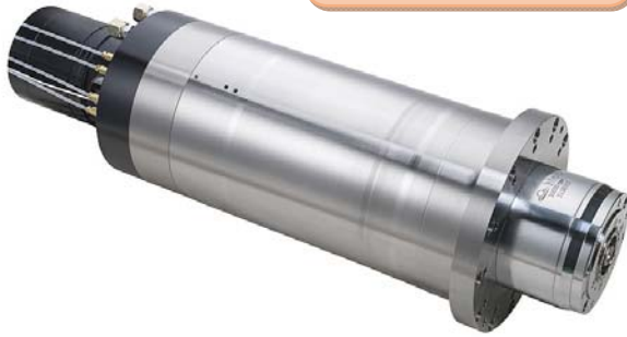
ATE AC 170/200/4