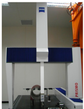
Zeiss Coordinate Measuring Machine